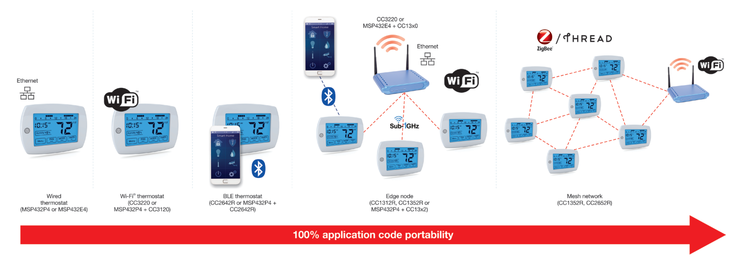
Figure 1. Application scalability examples