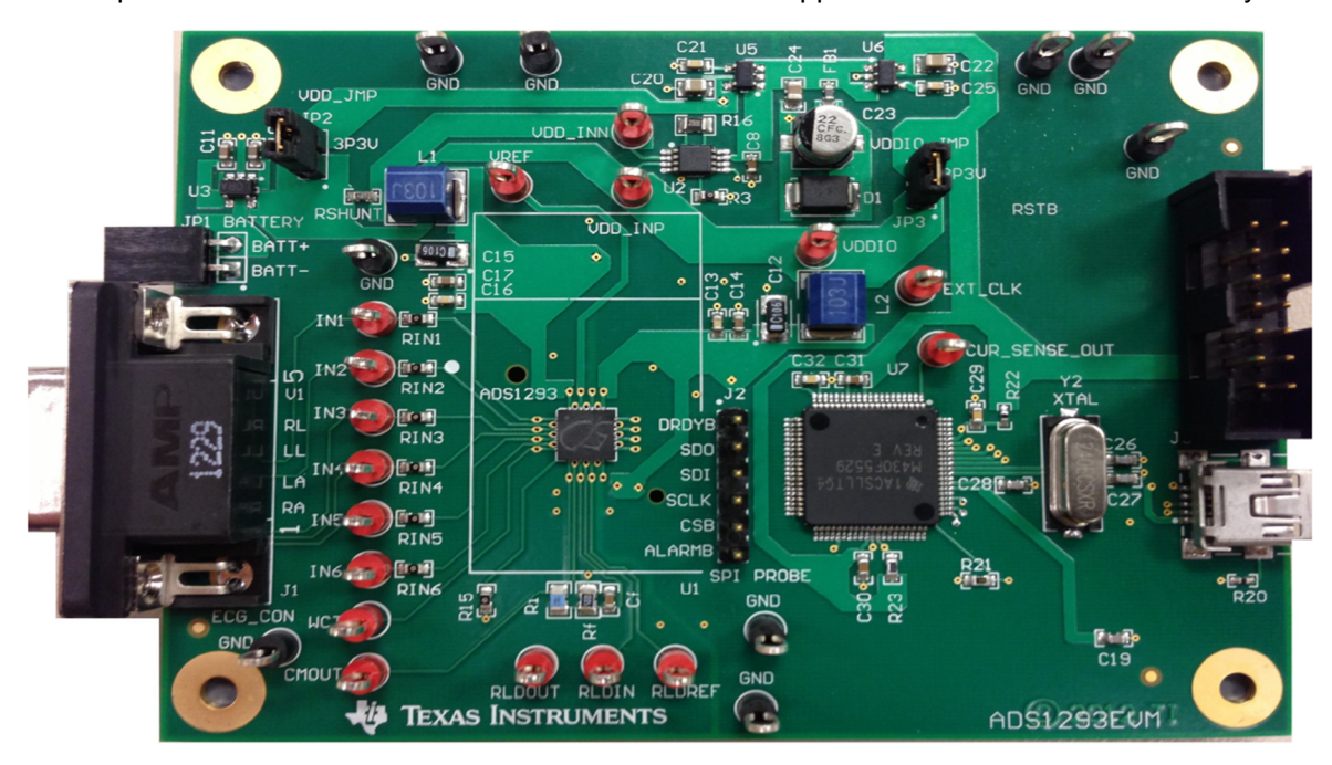
Figure 2. ADS1293EVM