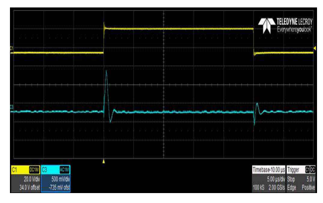
Figure 2. Typical Output Glitch From Large Input $V_{CM}$ Step

voltage steps. Because real-world amplifiers do not have infinite common-mode rejection potentially large, unwanted disturbances appear at the amplifier output corresponding to each input voltage step as shown in Figure 2. These output disturbances, or glitches, can be very large and take significant time to settle following the input transition depending on the characteristics of the amplifier.