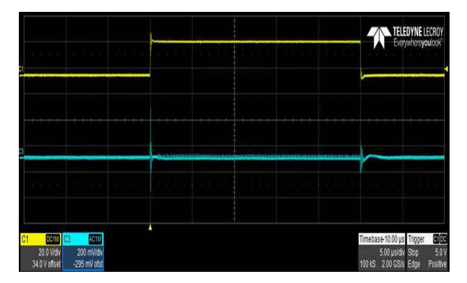
Figure 3. Reduced Output Glitch By Enhanced PWM Rejection

amplifiers rely on a high signal bandwidth to allow the output to recover quickly following the step, while the INA240 features a fast current sense amplifier with internal PWM rejection circuitry to achieve an improved output response with reduced output disturbance. Figure 3 illustrates the improved response of the INA240 output due to this internal enhanced PWM rejection feature.