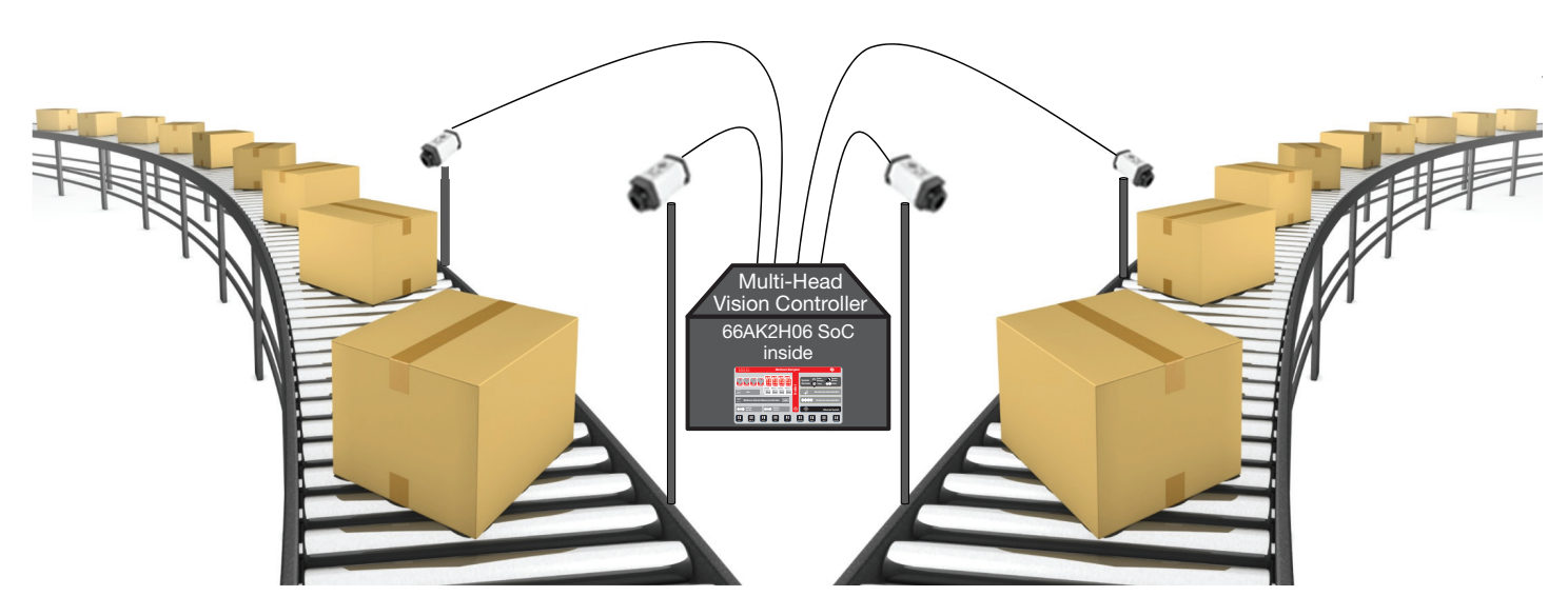
Figure 2 – Example of 66AK2H06 SoC used as the main processor in a multi-head vision controller used to control multiple cameras and run analytics in an industrial automation system

KeyStone II devices feature a network coprocessor AccelerationPac. This AccelerationPac consists of a packet accelerator and a security accelerator that work in tandem to offload the DSP and ARM cores. This enables high-performance network application processing while freeing the C66x DSP and Cortex-A15 processors for other functions like analytics, video encode/ decode, running the operating system (OS)